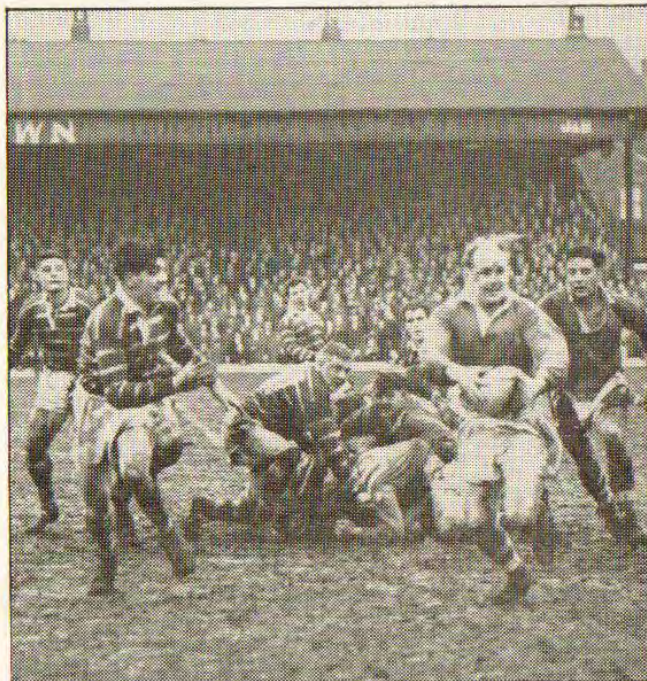
AN OLD FRIEND IN A NEW SETTING